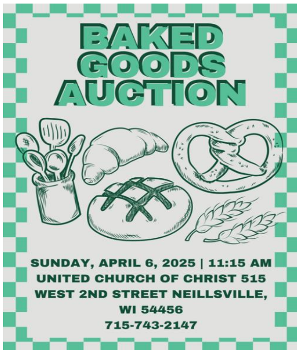
Baked Goods Auction Scheduled

We meet on the first and third Mondays of the month at 9 AM in the fellowship hall to work on making cards. On the second Thursday at 1:30 PM we gather for our monthly meeting.